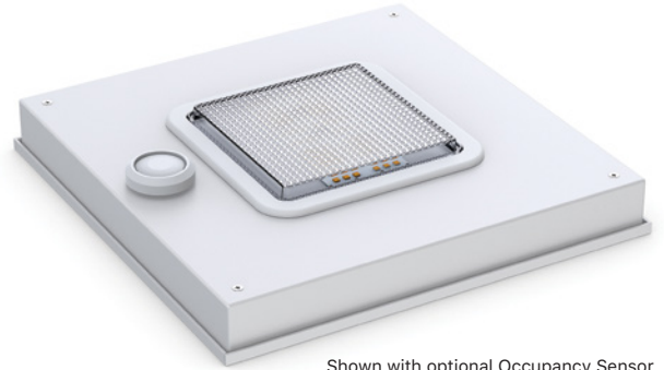
Shown with optional Occupancy Sensor