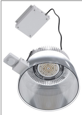
Remote Battery Backup connection to eLuminaire LED high bay fixture.